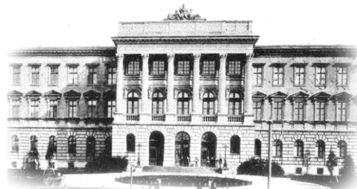
Lviv Polytechnic National University Main Building

Lviv Polytechnic National University Students' and PhD Students' Union and Self-government Young Scientists' Council